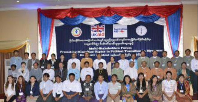
Gp Photo on Multi-Stakeholder Forum: Promoting Minorities' Rights in Political Transition in Myanmar (2018)

Multi-Stakeholder Forum : Promoting Minorities' Rights in Political Transition in Myanmar