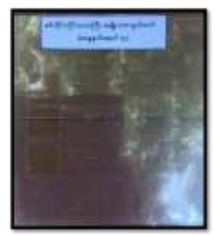
Braille Template for Amyother Hluttaw Constituency (4) -Sagaing Region (2015)

Collaboration with UEC for developing Braille template to vote by visually impaired person independently and secretly