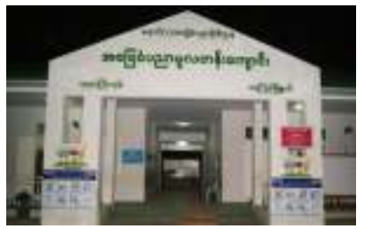
Model Polling Station at Yekyi tsp (2015)