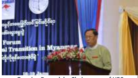
Opening Remark by Chairperson of UEC