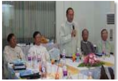
Advocacy Meeting with Union Parliament