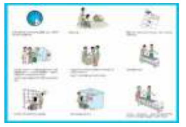
Inclusive Voter Education Materials on how to vote in Election