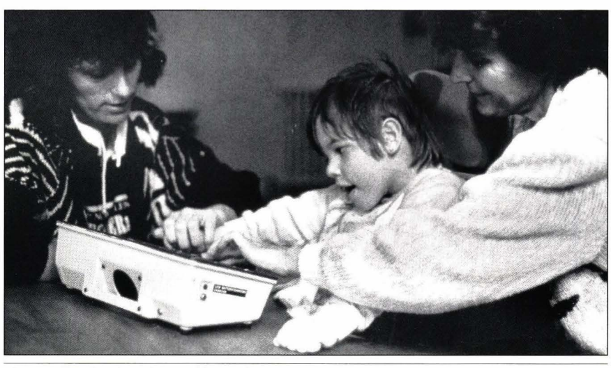
Plans can be developed to enable teaching to be carried out at home.