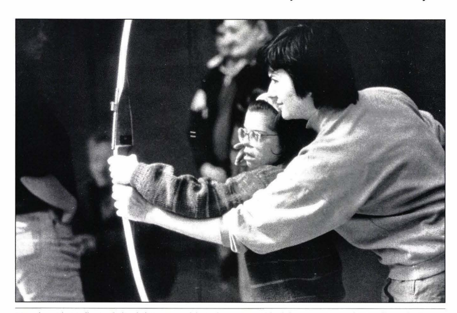
People with intellectual disabilities are able to learn, provided they are properly taught and given sufficient time.

The needs of people with intellectual disabilities have often been overlooked in programmes designed to reach disabled people in general. But we now have enough knowledge and skill to ensure that their needs are more fully met in the future. They